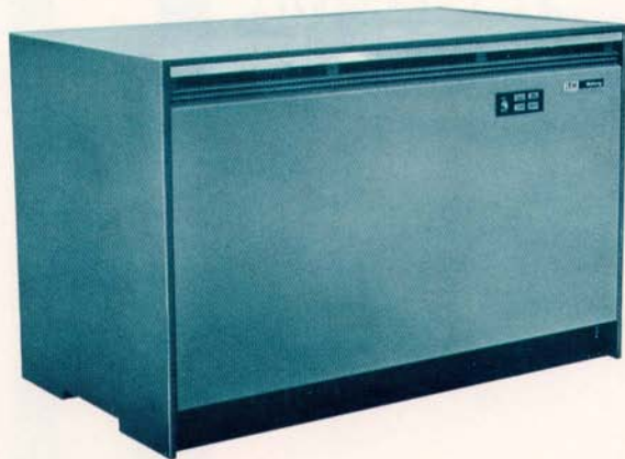
IBM 1026 Transmission Control Unit

The IBM 1026 Transmission Control Unit provides IBM with the means of entering the low-cost on-line TELE-PROCESSING® area. The IBM 1026 provides the necessary components to connect existing IBM terminal equipment, via half-duplex communication lines, to the IBM 1240, 1401, 1440, and 1460 Data Processing Systems. The transmission control unit is a single-line communication unit. Each unit can serve a number of terminals on one line, and as many as four units can serve a data processing system. Information from the communication line enters the 1026 serial-by-bit, serial-by-character.