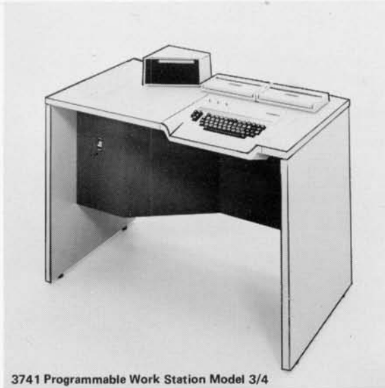
3741 Programmable Work Station Model 3/4